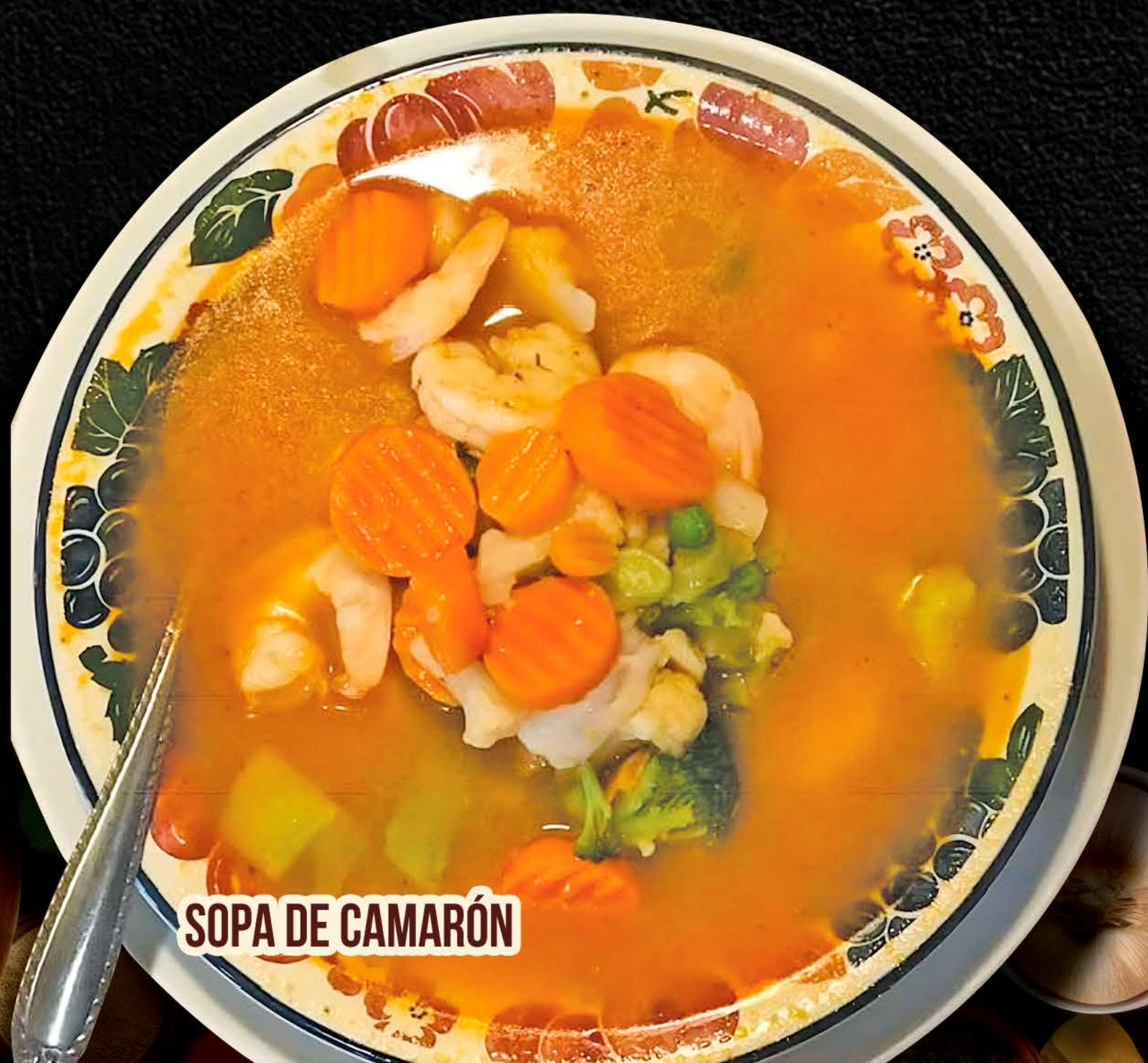
SOPA DE CAMARÓN