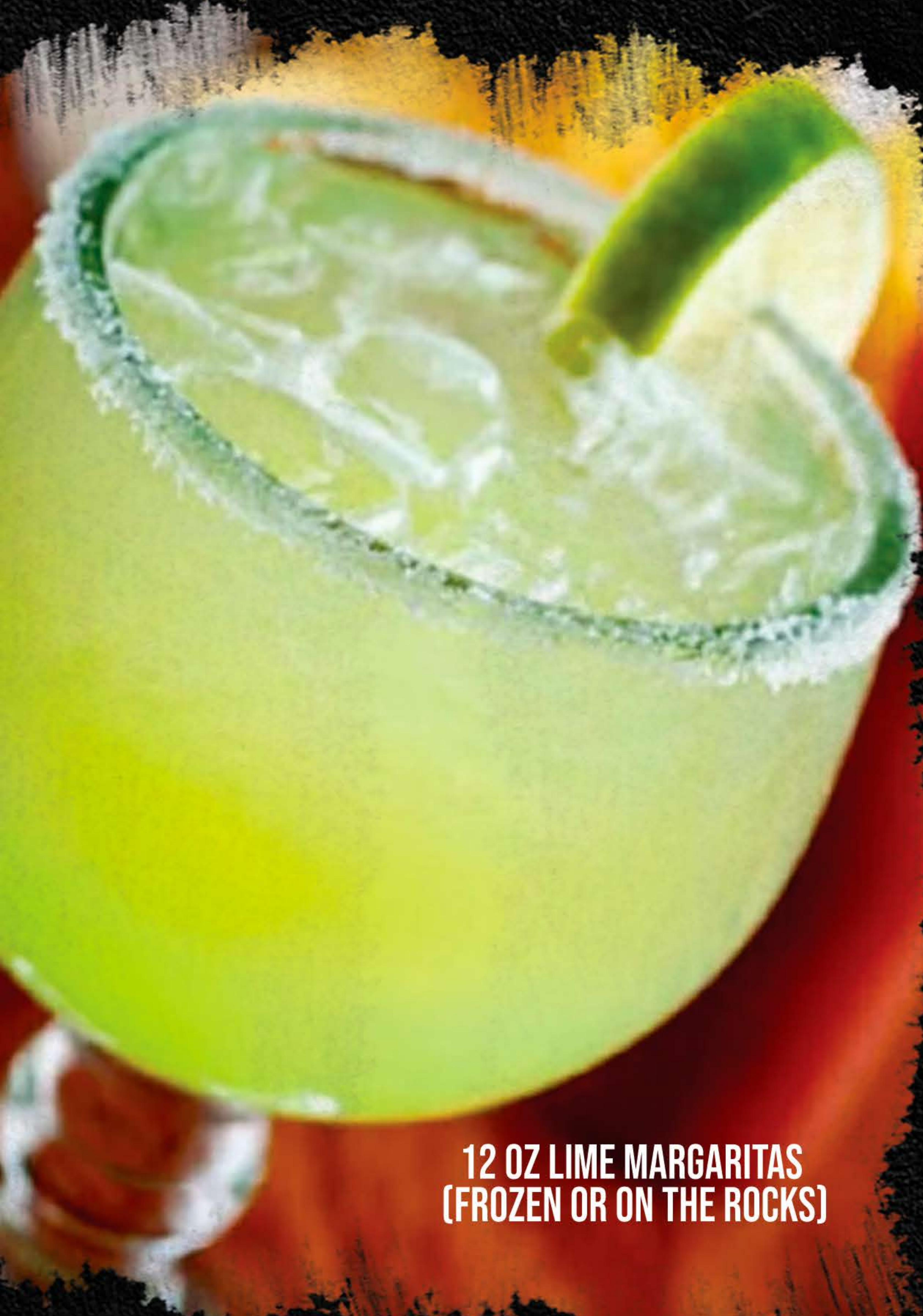
12 OZ LIME MARGARITAS (FROZEN OR ON THE ROCKS)

In order for us to serve you quickly, please have your picture ID ready when ordering alcoholic beverages. NO EXCEPTIONS